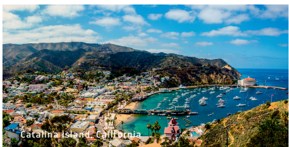
Catalina Island, California

Your clients can choose exhilarating, exotic vacation itineraries filled with family-friendly destinations — from the glittering isles of memorable west coast shores like Catalina Island, Ensenada, Mexico and beyond.