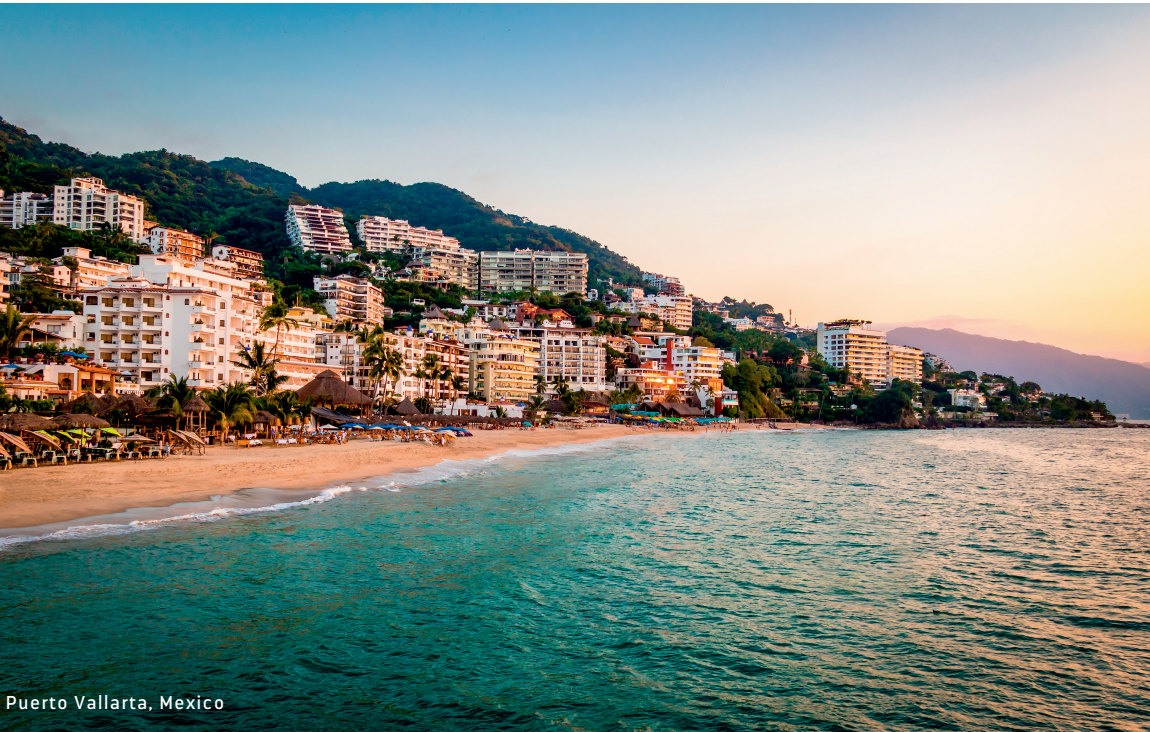
Puerto Vallarta, Mexico

*Additional charges apply for specialty dining venues.