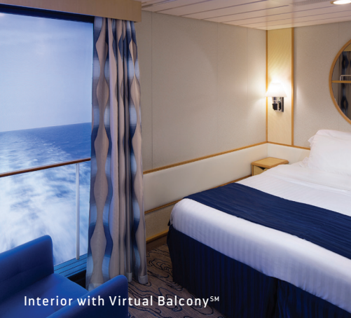
Interior with Virtual Balcony™