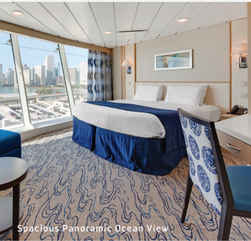
Spacious Panoramic Ocean View