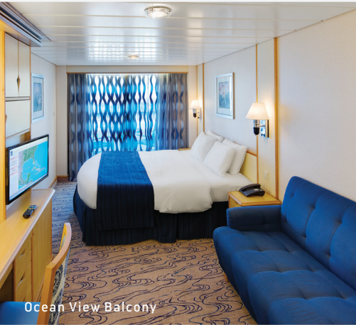
Ocean View Balcony